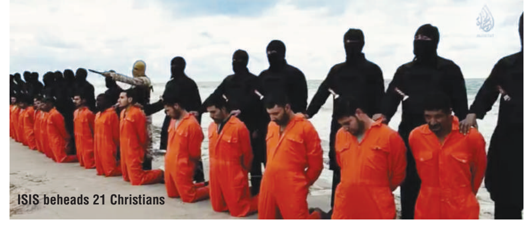
...not all martyrs are created equal. In the battle of ISIS versus Isa (Arabic: Jesus), we see two very different images. ISIS promises the glory of martyrdom to those who strap bombs to their chests and murder crowds—even in mosques!

Since then, we've witnessed the failed Arab Spring; dictators fell only to be displaced by chaos and civil war; terrorism surged. And now, the rise of ISIS and waves of religious persecution. The common thread has been death and